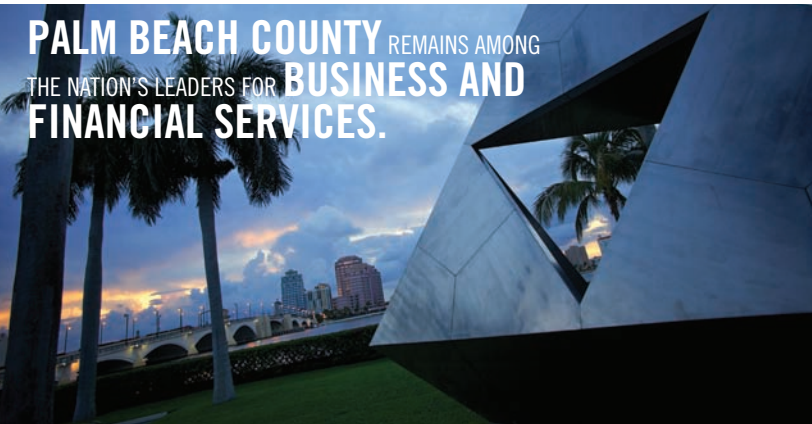
West Palm Beach skyline, as seen from The Society of the Four Arts, Palm Beach. Sculpture "Intetra" by Isamu Noguchi.

Many organizations choose Palm Beach County for cost efficiencies that include our tax structure, incentives, affordable real estate, and lower labor costs.