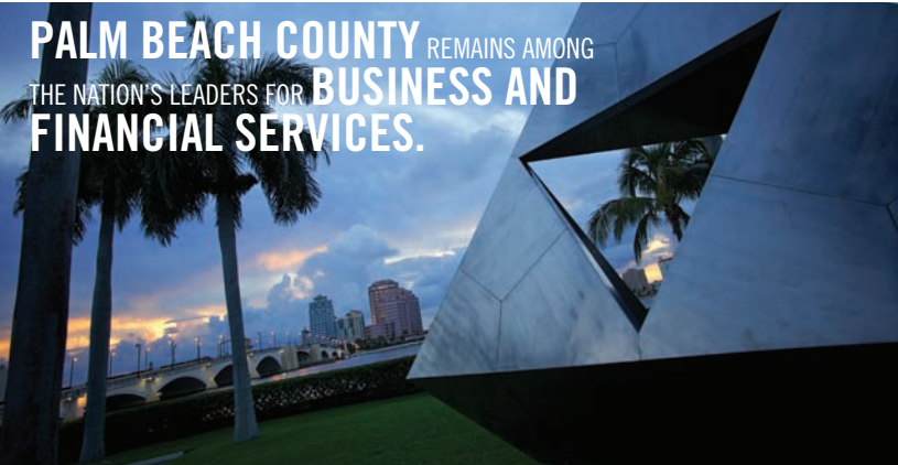
West Palm Beach skyline, as seen from The Society of the Four Arts, Palm Beach. Sculpture “Intetra” by Isamu Noguchi.

Many organizations choose Palm Beach County for cost efficiencies that include our tax structure, incentives, affordable real estate, and lower labor costs.