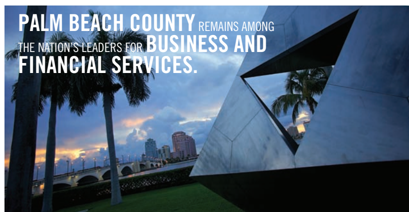
West Palm Beach skyline, as seen from The Society of the Four Arts, Palm Beach. Sculpture "Intetra" by Isamu Noguchi.

Many organizations choose Palm Beach County for cost efficiencies that include our tax structure, incentives, affordable real estate, and lower labor costs.