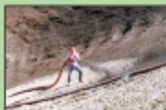
ECO-SOIL™ & POTTING SOIL