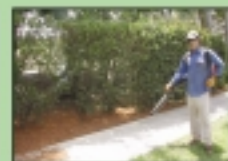
NO MESS LEFT BEHIND!