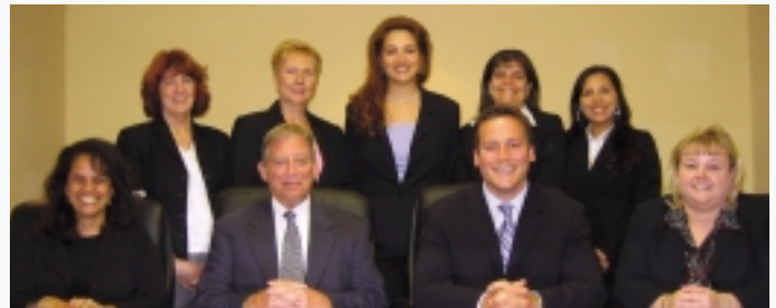
The Executive Team at Stress Free Corporate Housing

Corporations are well aware that employees away from home for extended periods of time tend to be less productive if living in an unfamiliar and uncomfortable environment. "We also provide destination service that includes help with learning about registering for local schools, motor vehicles, setting up banking, local restaurants, and help with initial food shopping". Clients choose Stress Free Corporate Housing for a variety of reasons such as; the apartments are more comfortable, homier feeling, full size kitchens, spacious bedrooms and are less expensive then hotels. Most complexes are gated; include such amenities as swimming pool, washer and dryers in unit, health club and in some cases tennis and golf. The day after arrival all guests receive a phone call from their account coordinator to make sure everything meets their expectations. A welcome package is also provided that contains some snacks, new address and phone number, emergency contacts, mailbox keys and number and gate codes.