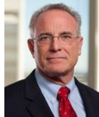
David Wells Business Litigation

In addition, 10 Gunster law practice areas were noted for the following in Chambers USA 2017 edition :