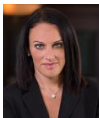
Elaine Bucher Private Wealth Services