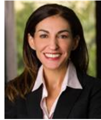
Luna Phillips Environmental & Land Use