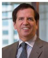
Alan Lederman Tax Law